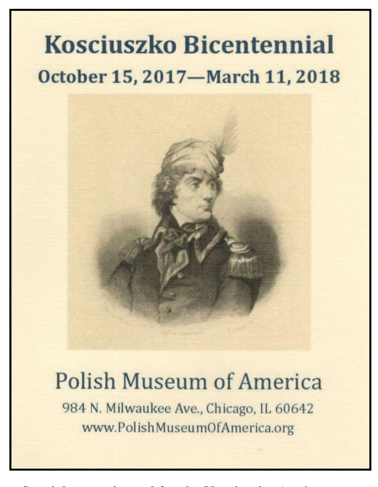
Special souvenir card for the Kosciuszko Anniversary.

It is always a special opportunity when a nonphilatelic exposition opens its doors to include our favorite hobby, philately, so thank you to the Polish Museum of America and Polonus for their efforts.