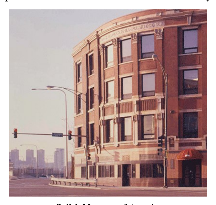
Polish Museum of America.