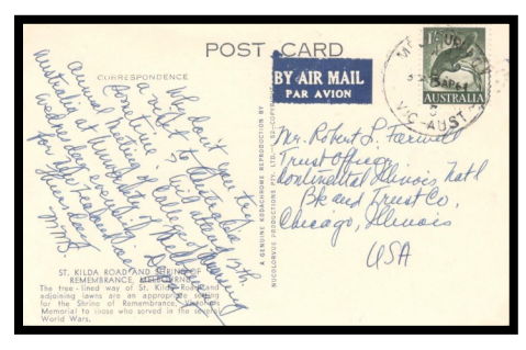
1964 air mail postcard, 1/0 platypus.

A survey of all the air mail covers from Australia to the U.S. that are in my collection to date proved 100% correlation with the chart when it was completed, so if you have a nonconforming cover, please let me know.